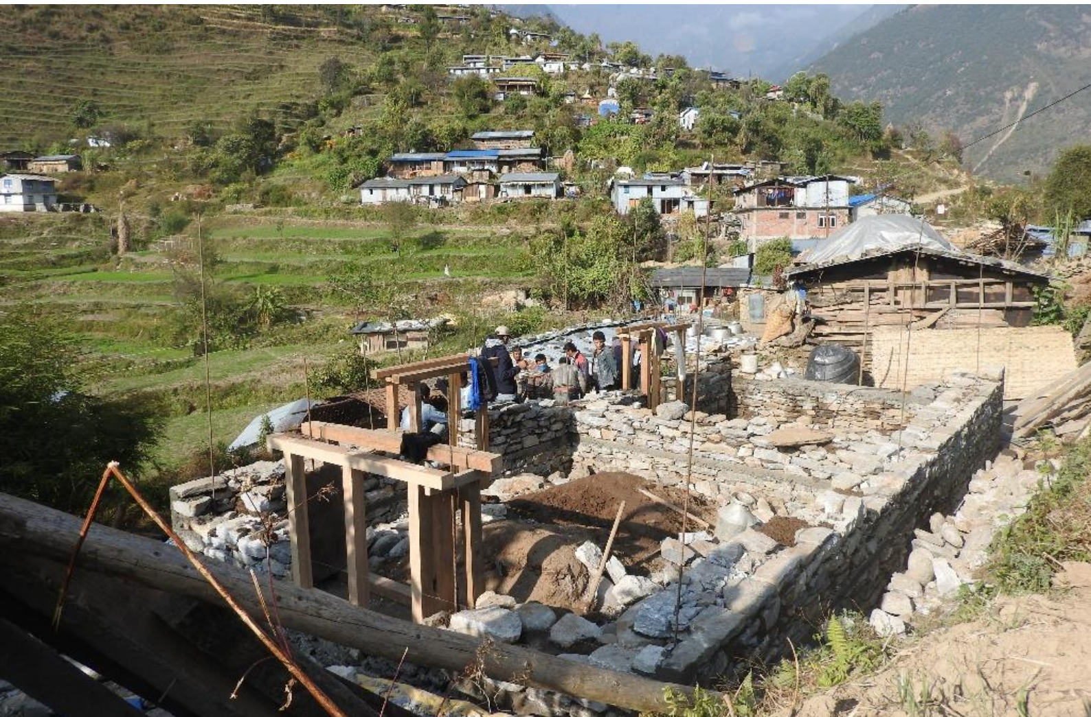
Figure 18: Aalampu Village being built safer and better

Till January 2018, in total 597 houses collapsed, 113 houses have been rebuilt, 280 are under construction in Aalampu. Among total beneficiaries, 525 have received first tranche of government grant, 261 and 108 have received second and third tranche of grant respectively. In this scenario, Baliyo Ghar Team has conducted 4 mason trainings enhancing the technical skills of 100 more local masons, 3 On-the Job Trainings (OJT) producing 24 new masons who are now contributing to build Aalampu Better and Safer.