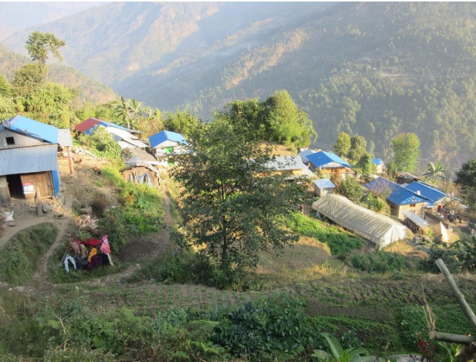
Figure 28: A view of Dampha village.

At a time when there is widespread criticism regarding the post-earthquake reconstruction process and progress, the story of a small Thami village of Dolakha District is quite opposite though.