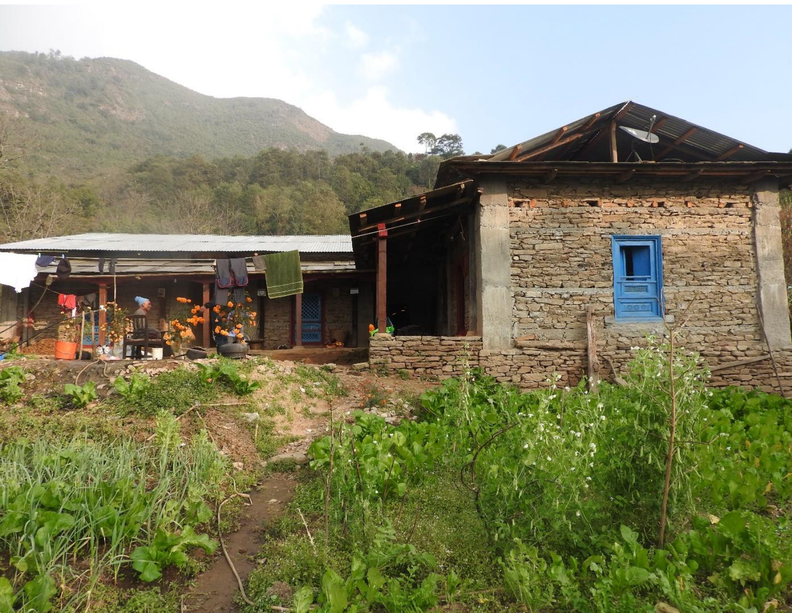
Figure 12: House of Khadka family, two houses have been separated by certain gap in between.