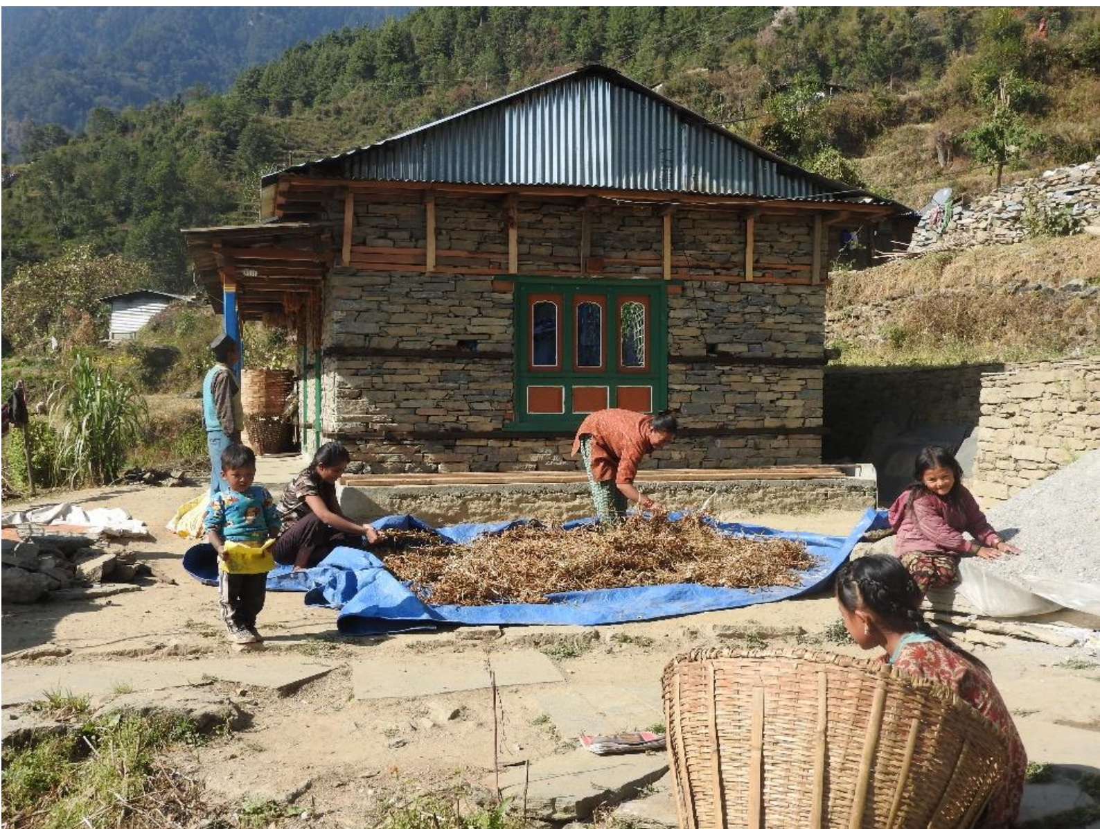
Figure 15: Family of Shanti Bhujel in their newly built house