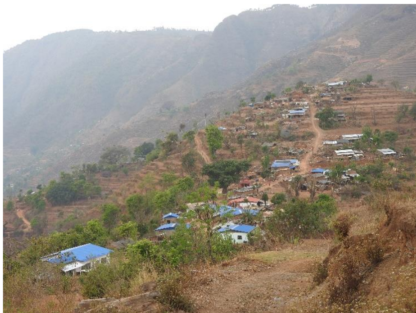
Figure 47: Pokhari Hatiya now

According to ward member Ganesh Kumar Shakya, before Gorkha Earthquake there were surplus resources of water around the village, which they had managed to supply through pipes and taps. But now the village has turned dry due to lack of water.