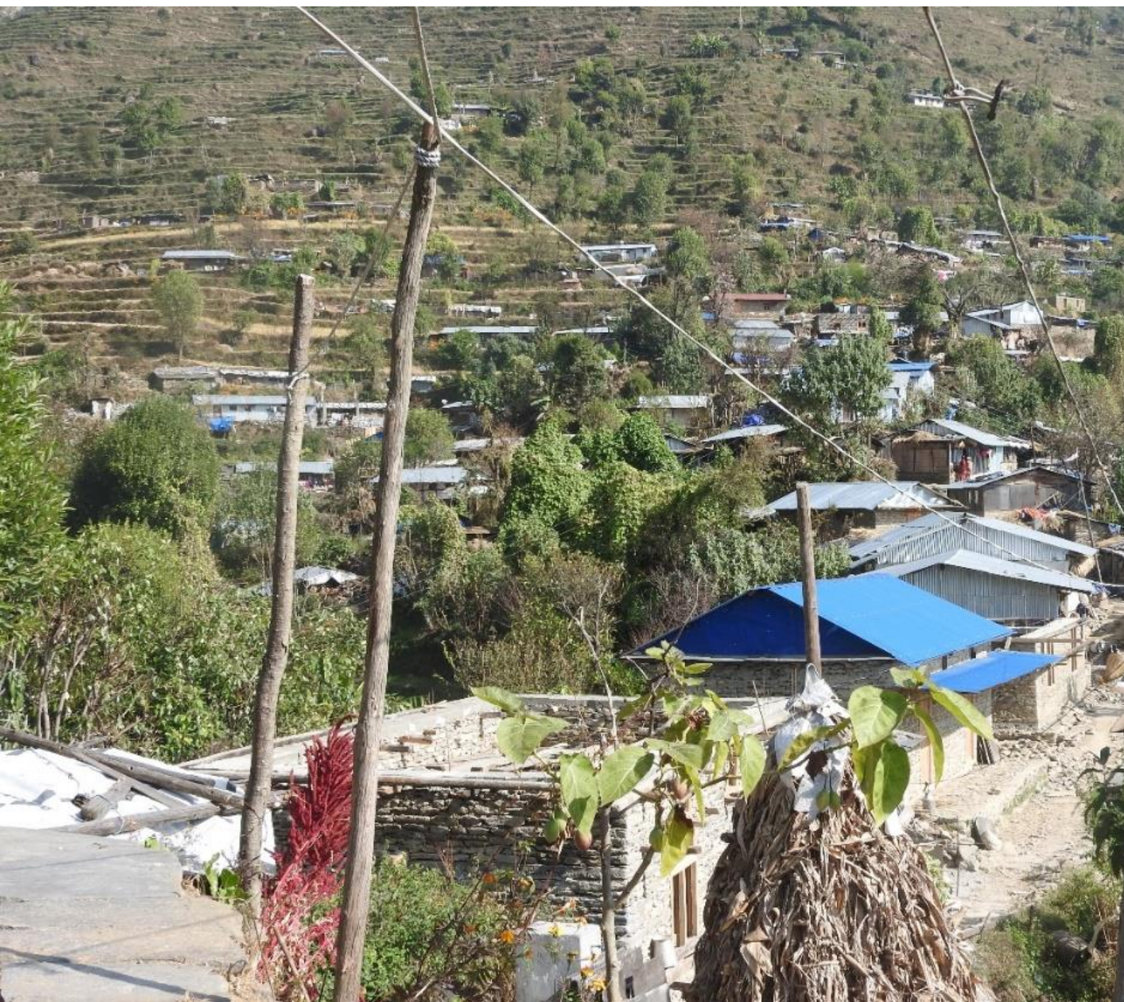
Figure 2 : Syankhu Village Being Built Safer