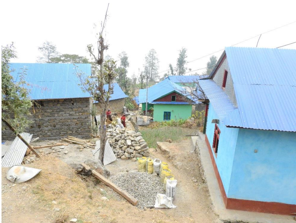
Figure 35: Bhasme Village of Chyama Dolakha reconstructed by 5 brothers