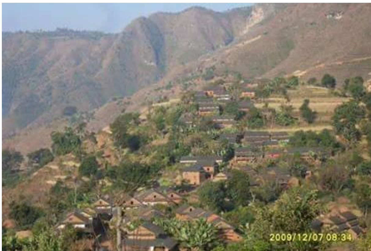
Figure 48: Pokhari Hatiya before Gorkha Earthquake