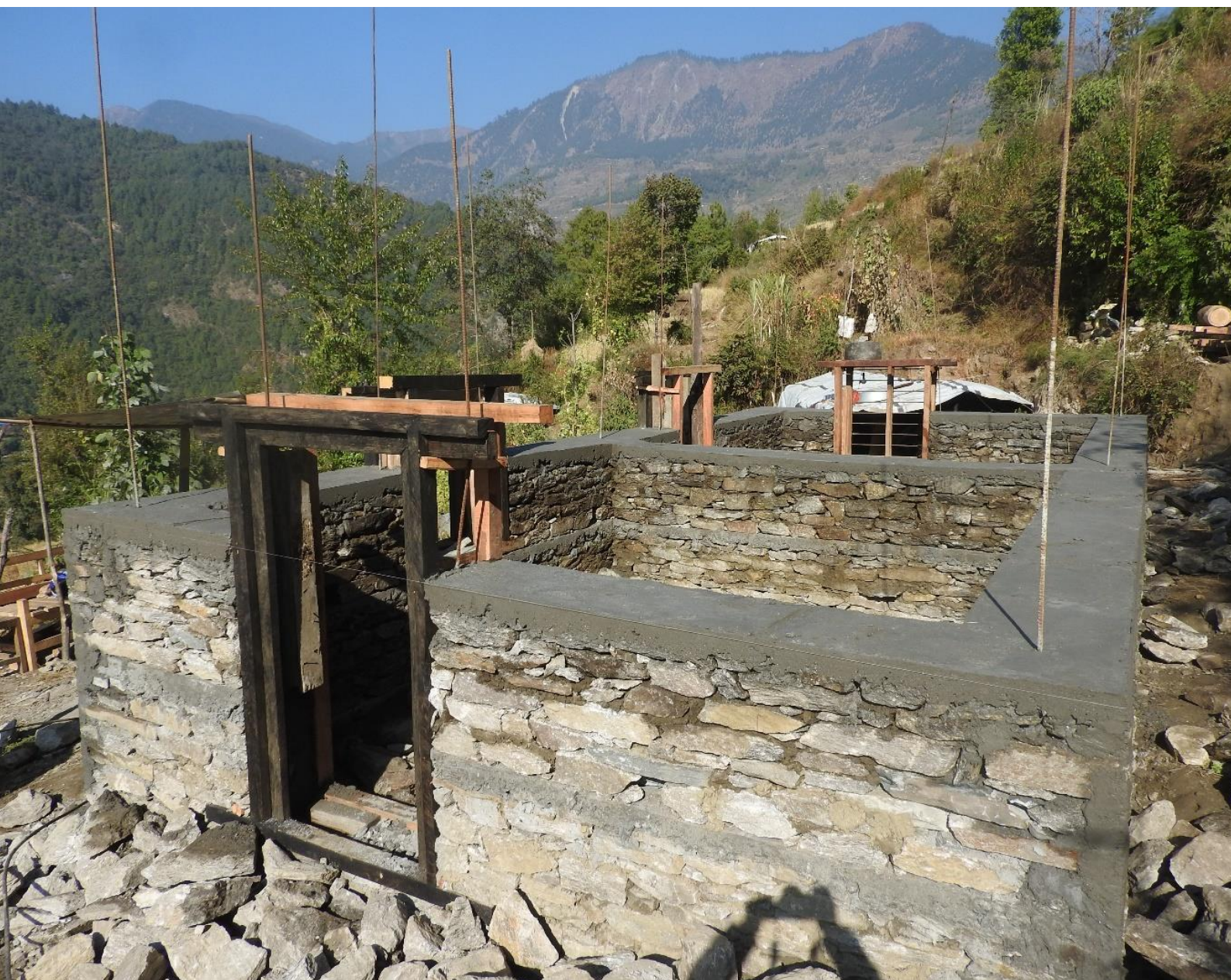
Figure 6: Earthquake resistant house being built in Loting, Chilankha