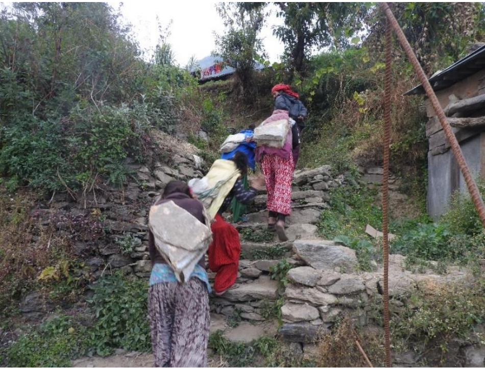
Figure 17: Girls of Aalampu carrying stones on their back from a distant stream to construct their houses

Till January 2018, in total 597 houses collapsed, 113 houses have been rebuilt, 280 are under construction in Aalampu. Among total beneficiaries, 525 have received first tranche of government grant, 261 and 108 have received second and third tranche of grant respectively. In this scenario, Baliyo Ghar Team has conducted 4 mason trainings enhancing the technical skills of 100 more local masons, 3 On-the Job Trainings (OJT) producing 24 new masons who are now contributing to build Aalampu Better and Safer.