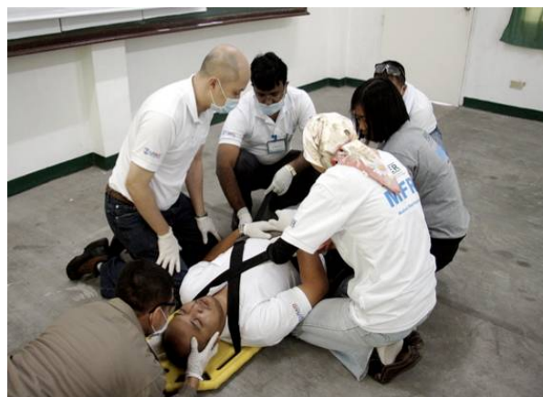
Participants strapping the patient on a long backboard in preparation for transporting the patient. (MFR Refresher Course, January 12-16, 2009, Philippines)

These refresher courses aim to upgrade the knowledge and skills of inactive PEER graduates on key concepts like Basic Life Support (BLS) and cardiopulmonary resuscitation (CPR) for MFR; and International Search and Rescue Advisory Group (INSARAG) Guidelines, for CSSR.