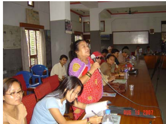
A meeting for the preparation of EAP-Dharan