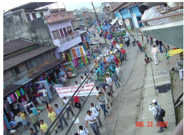
Earthquake Awareness Rally, EAP Dharan 2007