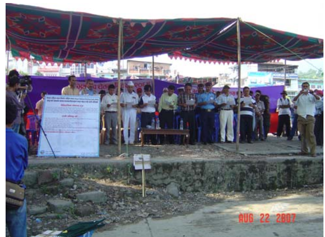
A ceremony for announcement of Nepal National Building Code Implementation in Dharan Municipality