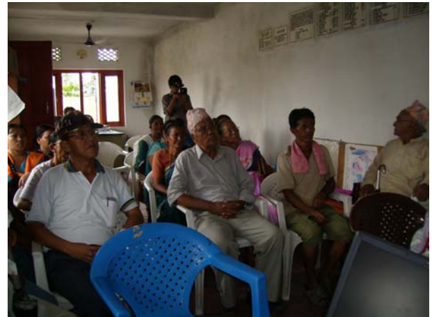
Community Awareness Program in ward no. 8 Dharan Municipality