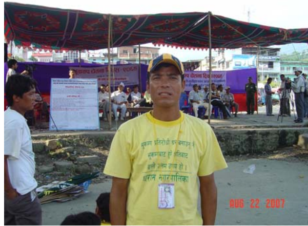
One of the trained masons in Dharan wearing printed vest and card as an identity of mason