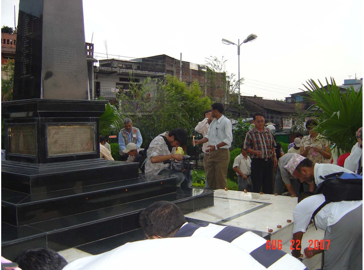
Lighting the lamp in commemoration of the people killed by 1988 Earthquake

The ceremony of announcing building code implementation in Dharan was followed by a program for lighting lamp and 1 minute commemorative silence in commemoration of the people killed by 1988 earthquake. This program was organized in the earthquake memorial park, Bhanuchowk near the Dharan clock tower.