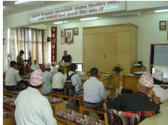
Community Awareness Program in ward no. 15 Dharan Municipality