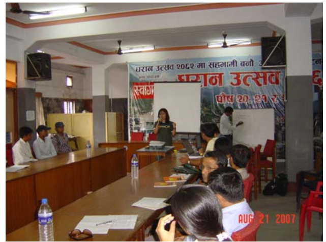
Training on Nepal National Building Code