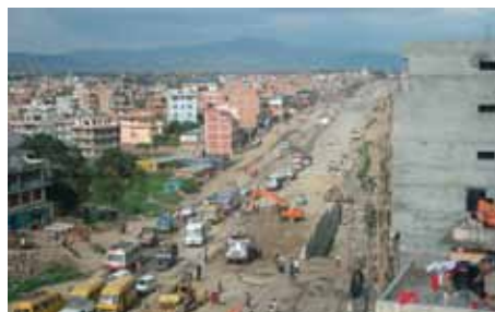
The Kathmandu-Bhaktapur road project

Running any urban projects especially roads entail various challenges. One of the first challenges when the project started was the relocation of utilities. This was not an easy task as Kathmandu is an old city and these utilities were first laid in an unplanned manner. Relocating them while still maintaining the continuation of services provided by these utilities to the locals was quite difficult. In addition to this, the relocation of trolley poles proved to be tricky as many parties and line agencies were involved. Various other daily challenges included managing the heavy traffic during construction phase in a smooth manner, traffic accidents resulting mainly due to poor traffic ethics and its violations, environmental issues such as dust pollution, damages to the utilities caused due to the construction