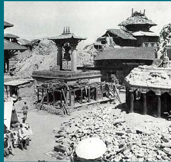
1934 earthquake in Nepal

The Great East Japan Earthquake was a historical mega-quake of 9.0 magnitude, which disastrously affected very wide areas in Japan. But one has to note the fact that less than seven percent of deaths were caused by the earthquake itself. Ninety three percent of the deaths were actually caused by Tsunami. That means the countermeasures for earthquakes efficiently worked although the countermeasures for Tsunami did not. What we need to learn from this is we can significantly minimize the earthquake damages in Nepal by seriously undertaking appropriate measures and actions of the preparedness and mitigation because we will never have Tsunami in Nepal. This is what I would really like to emphasize.