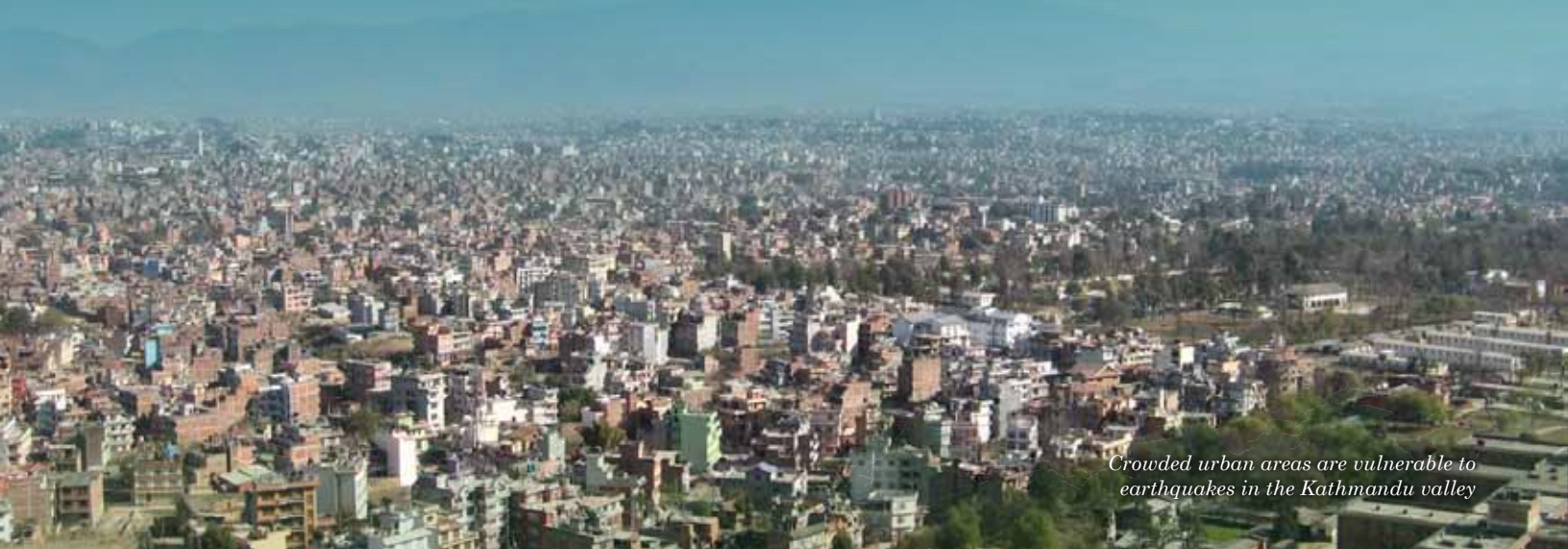
Crowded urban areas are vulnerable to earthquakes in the Kathmandu valley

Earthquake preparedness starts from an individual. People tend to think that it is the sole responsibility of Government but one has to remember that it is the combined responsibilities of all entities including civil societies, local communities and individuals to brace up for all kinds of mitigation, preparedness, response and recovery efforts. It will take time for governmental or outside help for any rescue efforts. Therefore, individual and community's actions for an earthquake are very important. One should be pre-prepared for such situations. This is recommended in Japan as well.