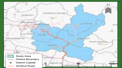
SRC area map

The SRCAMP is the three-year project aiming at the formulation of a master plan until 2020, to promote the High Value Agriculture (HVA) in the SRC area, with target districts of Kavre, Dolakha, Ramechhap and Sindhuli, as shown in the map. The Study will be carried out through three phases, i.e. Phase 1 for the analyses of current and future situations with regard to the potential HVA products and to develop the draft basic development strategy for SRC area, Phase 2 for the verification of the draft basic development strategy through carrying out the pilot projects, and Phase 3 for the adjustment of the strategy by reflecting the lessons learned from pilots and the formulation of the master plan. The study team consists of six Japanese experts who will jointly work with Nepali counterparts from MoAC throughout the study period, which is expected to be completed by March 2014.