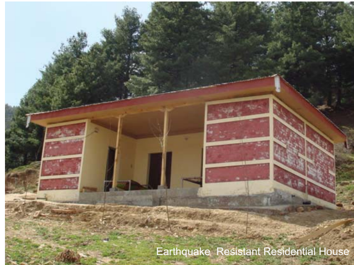
Earthquake Resistant Residential House

United Nations Human Settlements Programme (UN HABITAT) : The United Nations Human Settlements Programme, UN-HABITAT, is the United Nations agency for human settlements. It is mandated by the UN General Assembly to promote socially and environmentally sustainable towns and cities with the goal of providing adequate shelter for all. UN HABITAT is one of the major implementing partners (IP) of ERRA in Pakistan for Rural Housing Reconstruction Programme and has been providing technical support to communities and different Partnering Organizations for earthquake-resistant reconstruction through Housing Reconstruction Centres (HRCs) in earthquake affected areas.